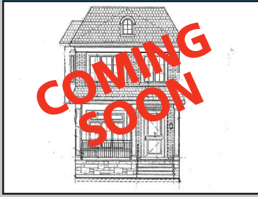
NEW CONSTRUCTION-PRIME MOORE PARK