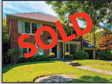
121 STRATHEARN ROAD