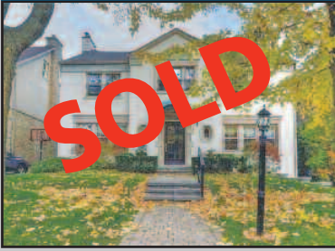
5 GLEN CEDAR